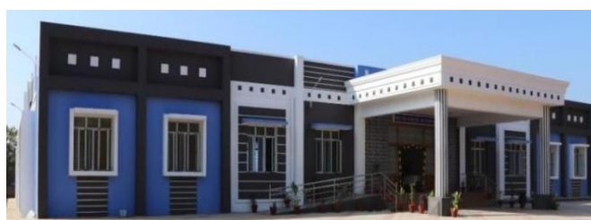
CDOE Annex - Silver Jubilee Building