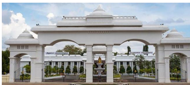
University Administrative Building