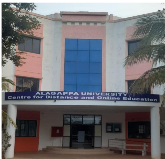
CDOE Main Building